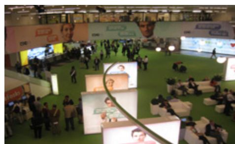
Above: View from above meeting area

despite issues with funding, regulatory bodies, etc that are clearly commonplace everywhere, there is still a lot of important great work being done and many more research questions to be answered.