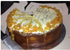
Above: 600th patient celebration cake

In November the 600th patient was randomised into a CTNZ trial. This milestone was achieved by the SIRFLOX trial however it should be mentioned that the SOLD study did randomise 2 patients only a few days later. Established in 2003, CTNZ was developed to assist clinical researchers and the existing Cancer research units by creating an adaptive infrastructure to facilitate more rapid development of new ideas from investigators across all disciplines. CTNZ has continued to provide support to researchers where it has been needed and this can be seen as a direct reflection of the number of patients that have participated in trials run by CTNZ. We would also like to thank all the coordinating centres in New Zealand for their support and enthusiasm for trials we have run past, present and future.