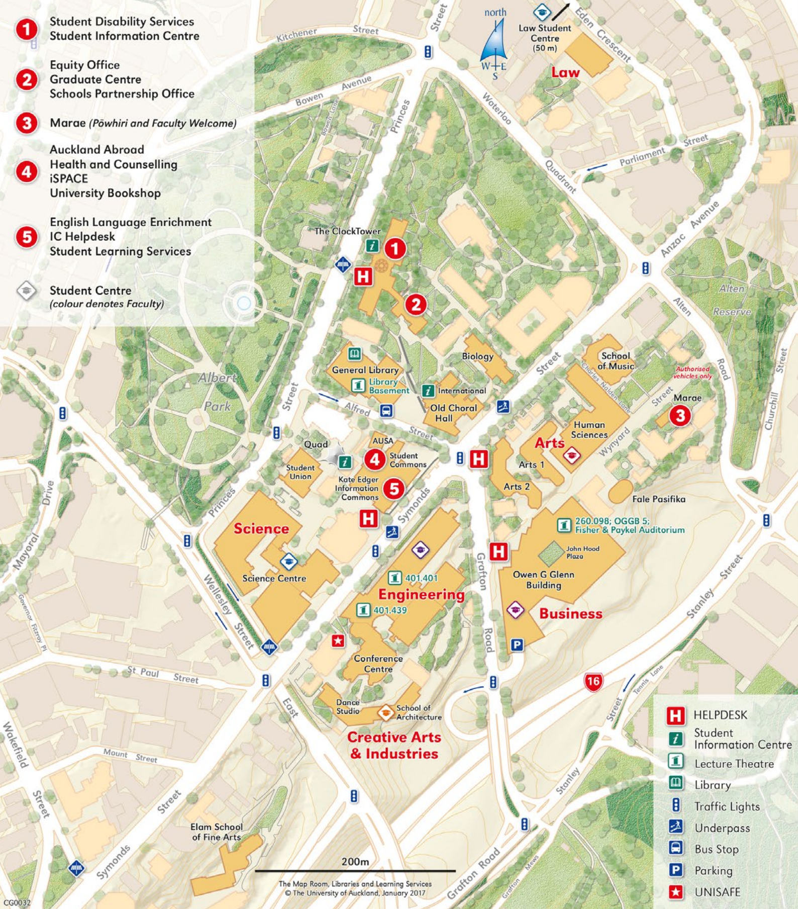
The Map Room, Libraries and Learning Services © The University of Auckland, January 2017