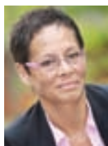
Dr. Teuila Percival

Progressing tobacco control in Niue. Analysis of tobacco promotions and advertising in the Pacific Islands countries (PICs). A review of NCD prevention and control in the Pacific. Youth perceptions of the graphic warning labels and plain packaging.