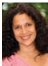
Professor Shanthi Ameratunga

Adapting to climate change: small island states. Estimating the public health benefits of measures to reduce greenhouse gas emissions. The global burden of disease due to second hand smoke.