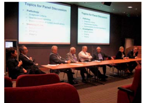
NET Workshop panel discussion